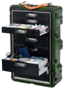
MC8100-0080-130 Medchest 8 drawer