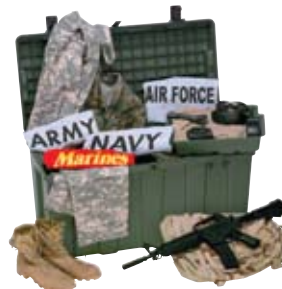
472-TRLK-S-032 Military trunklocker