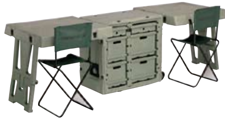
FD3429-0000-130 Double Duty Field Desk