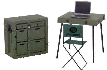
472-ADMIN-DESK-032 Administrative Field Desk