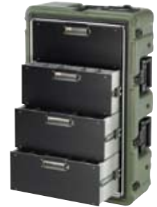
MC4100-0040-130 Medchest 4 drawer