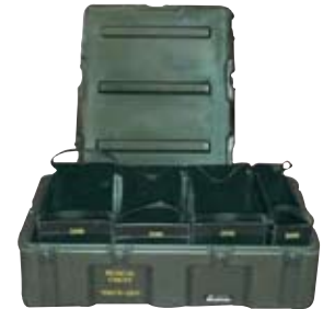
472-MED-4-TOTE-032 Med 4 tote