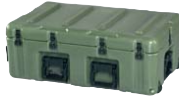
MC3000-3018-130 Medchest 3