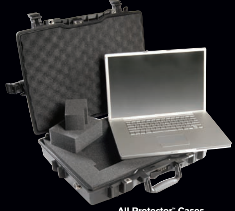
All Protector® Cases come standard with Pick N Pluck® foam.

Pelican's Pick N Pluck™ foam lets you customize the interior according to your gear. An easy, do-it-yourself system for custom-shaping the interior of the case according to your equipment. Layers of foam are pre-scored in tiny cubes. Simply measure your equipment over the grid and pluck away. Contents stay in place and get extra protection at the same time.