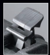
New Stronger Double-Throw Latch

The secret is the tongue-and-groove fit with Polymer o-ring acting as a waterproof seal. Also, the new Automatic Pressure Equalization Valve releases built-up air pressure while keeping water molecules out, resulting in a watertight case that is even easier to open.