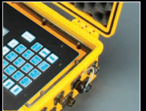
Panel frame mounting system

Customize your case to hold electronic interface panels, or create the perfect protection insert for your equipment. Close the lid and see your logo applied as a decal or hot stamp (call for details).