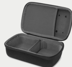
STA-300-B13 Case Black: Pouch & Divider