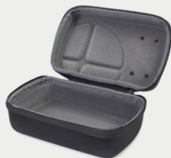
STA-300-B11 Case Black: Empty