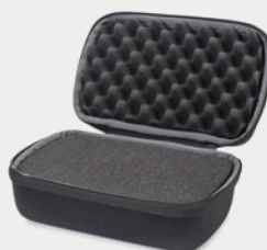
STA-300-B12 Case Black: with Foam